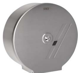
SLZN 37 95370 Stainless steel holder for a big coils of toilet paper