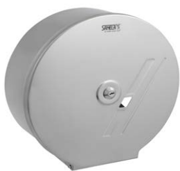
SLZN 01 95010 Stainless steel holder for a big coils of toilet paper