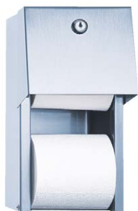
SLZN 26 95260 Stainless steel holder of toilet paper