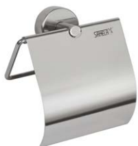
SLZN 09 95090 Stainless steel holder of toilet paper