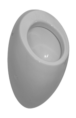
SLP 25 - ALESSI WITHOUT A COVER