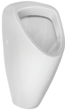
SLP 49 - CAPRINO PLUS